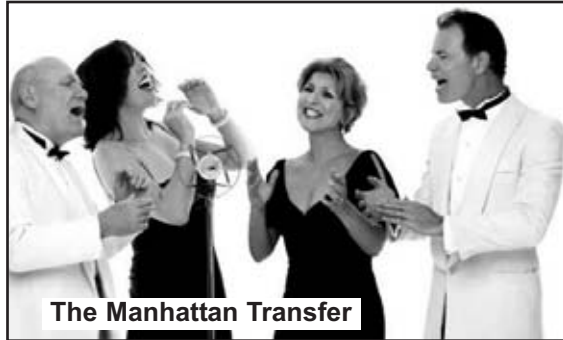
The Manhattan Transfer

Second in the series is The Smothers Brothers at 8 p.m. Saturday, Nov. 22. Time has been an essential ingredient in the Smothers Brothers' success. Tom and Dick Smothers—masters of timing and practitioners of timeless comedy—were considered ahead of their time with their highly popular prime-time television show in the 1960s. Now, on the eve of their 50th anniversary as show business professionals, the Smothers Brothers are saluted as time-honored legends, whose lengthy career has surpassed all other comedy teams in history. With their singular blend of comedic and musical