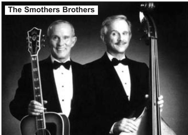
The Smothers Brothers

Featuring an eclectic collage of dance, music and theatre in the Eisemann Center's concert space, the Spotlight Series kicks off with "Girls Night: The Musical" with four performances Oct. 23-25. "Girls Night" is a tell-it-like-it-is look at five friends as they relive their past, celebrate their present and look to the future on a wild and hilarious karaoke night out ... and you'll recognize every one of them! "Girls Night" is bursting with energy and is packed with every female anthem you can think of including "Girls Just Want to Have Fun," "I Will Survive" and "Say a Little Prayer."