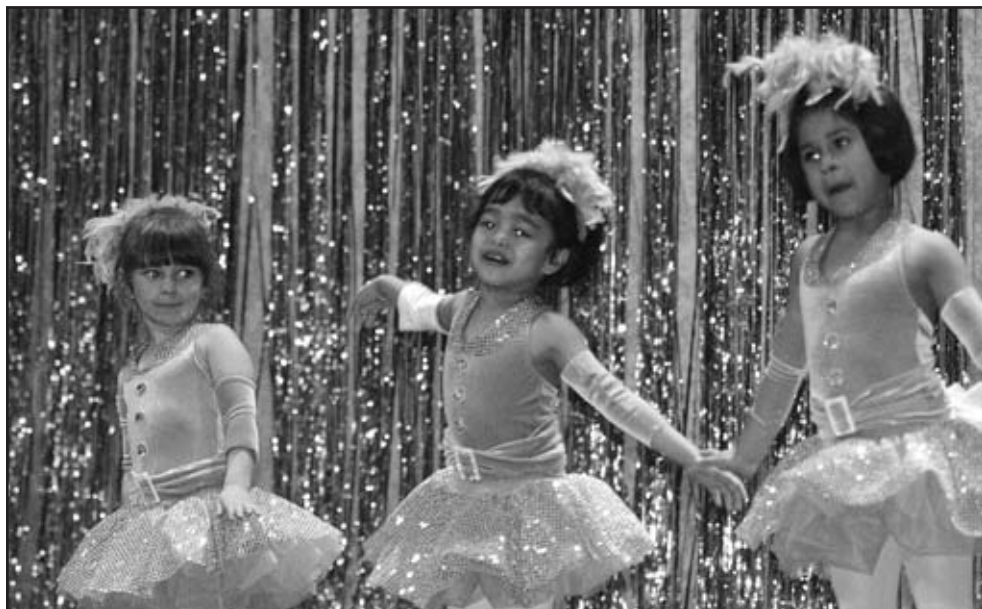
TINY DANCERS —Recitals at Richardson High School for Heights Recreation Center dancers (above) and at Berkner High School for Huffhines Recreation Center dancers (below) culminated the Spring 2008 dance semester at Richardson Recreation Centers.