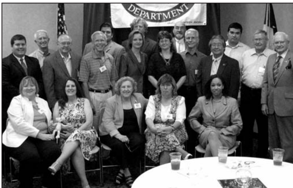
The Richardson Police Department recently celebrated the graduation of Class 30 from the Citizen Police Academy (CPA). Founded in 1992, the purpose of the CPA is to provide residential and corporate citizens a realistic look at modern policing, while promoting understanding of the mission and operations of the Richardson Police Department. Interested persons should contact the Crime Prevention Unit at 972-744-4955 for additional information and application.