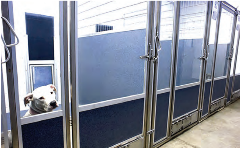
The above photo is an example of what the new enclosures at the Animal Shelter might look like.

When voters approved the 2015 Bond Program in November 2015, funding was set aside for public buildings. Included in this was money to upgrade the Animal Shelter’s kennel suites, which can house up to 44 dogs. The upgrades will remove the existing chain link fencing in the dog holding areas and replace it with stainless steel and tempered glass enclosures featuring watertight seals. Current dog doors will be replaced with models that provide a more controlled air-conditioned environment. Additionally, floors will be sealed with a three-coat epoxy coating for cleaning and sanitation and new acoustic panels will be installed to replace worn baffles and aide in noise reduction. Work is expected to start on the upgrades early next year and take a few months to complete. Due to COVID-19, the Animal Shelter is allowing visitors by appointment only. Appointments can be made for adopting a pet, for reclaiming or surrendering a pet, or any other services. To make an appointment, call 972-744-4480 or e-mail askanimalshelter@cor.gov . For more information, visit www.cor.net/animalshelter .