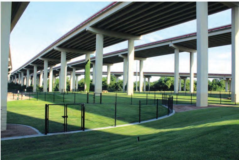
The small dog area is separated from the space for sedentary and older dogs.