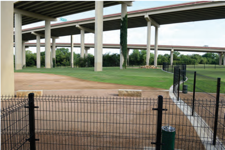
An area is available for large dogs that is separate from the area for small dogs.