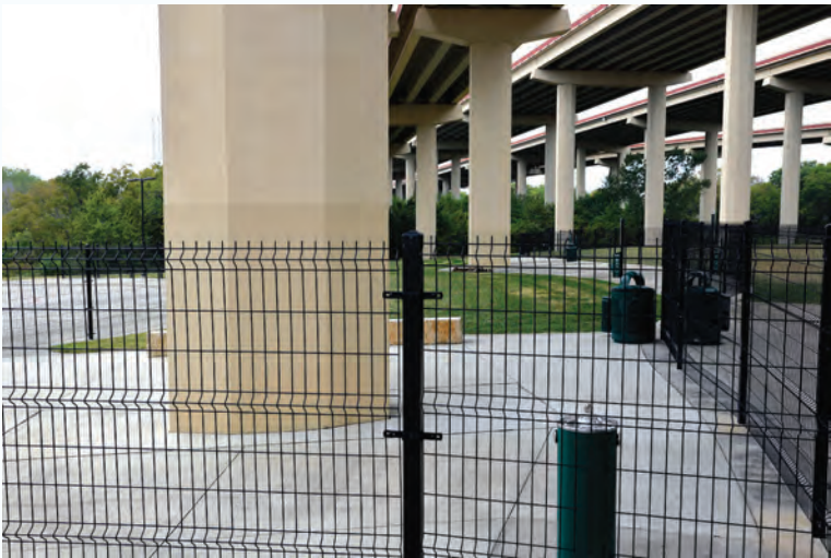
An area is available for doggy birthday parties and other pet-friendly rentals.